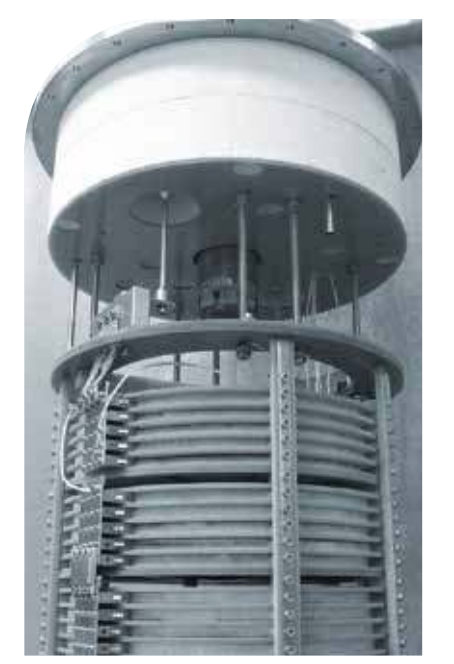
FCL Coil with AMSC's Amperium Stainless Steel Wire.

Manufactured using a high-volume and proprietary process, AMSC's stainless steel laminated wire is available in 12 mm width. The wider, higher current wire is designed for high power distribution and transmission level current limiters.